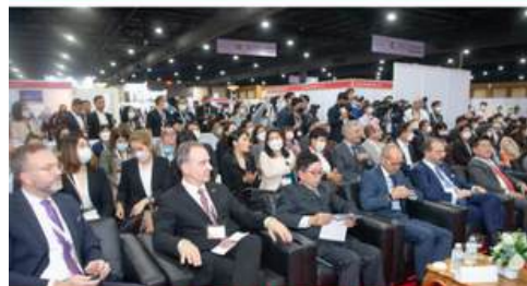
PRESENCE OF KEY INDUSTRY LEADERS